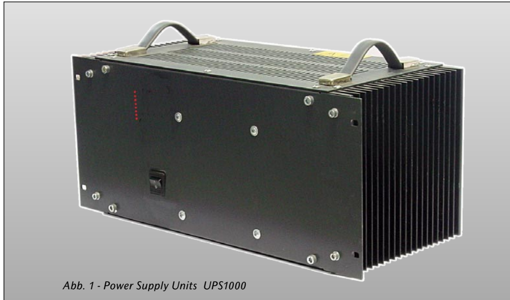
Abb. 1 - Power Supply Units UPS1000

Three different power supply units are available, the UPS1000, UPS10 and UPS25. The UPS1000 can be used with 5MT console with up to 48 modules, if there are no modules that require high supply current, like all modules with dynamics sections do. For most of the larger 5MT consoles, the power supply the UPS10 is