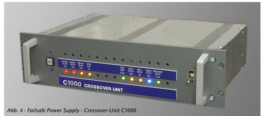
Abb. 4 - Failsafe Power Supply - Crossover-Unit C1000

Due to the low drop Shottky type power diodes, the power and heat dissipation of the C1000 cross over unit is rather low, even under full load condition. Additional ventilation is not required and the installation is not critical as far as the airflow is concerned.